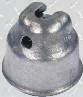
SOCKET CAP (45 KN to 300 KN)