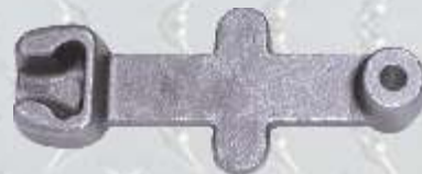
SOCKET EYE (HH TYPE)

FINISH: Self Colour and Hot Dip Galvanised